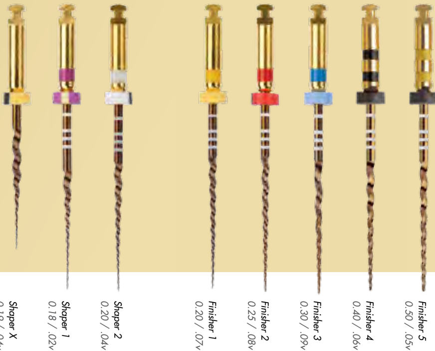
Shaper X 0.19 / .04v

ProTaper Gold Finishing Files provide the trusted deep shapes that promote 3D cleaning and filling root canal systems.