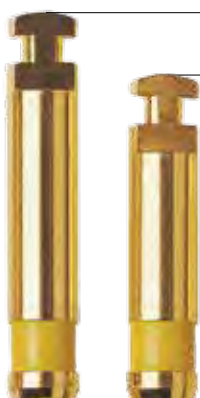
ProTaper 13 mm