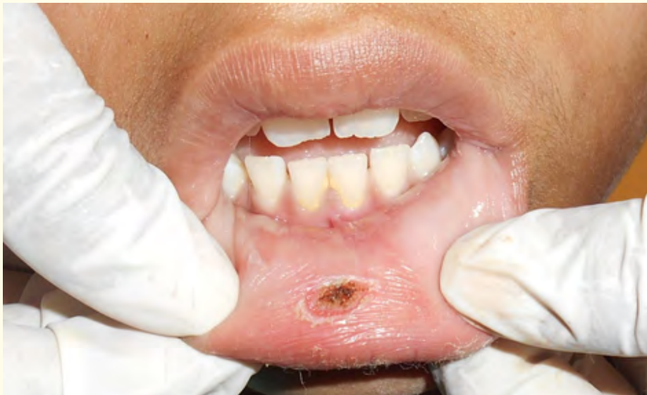
Figure 4: After excision of the lesion.

After complete laser excision, lesion was sent for histopathological examination. On the basis of clinical and histopathological examinations, it was confirmed the diagnosis of capillary hemangioma of lower lip (Figure 4,5).