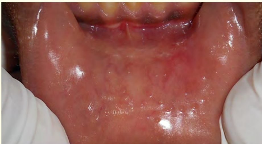
Figure 7: Post-Operative view after 1 Month.