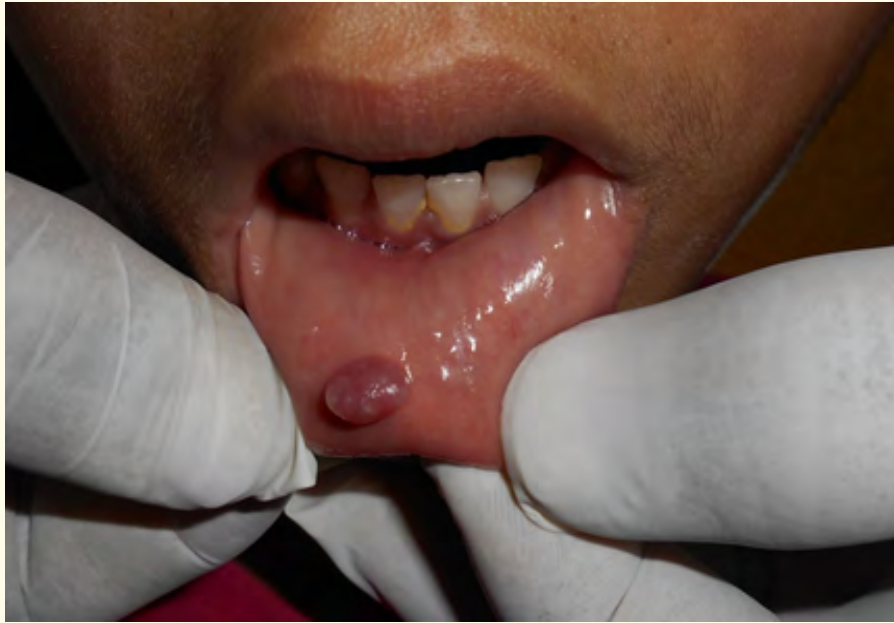
Figure 1: Pre-Operative view of lesion.

The patient's parents were informed about both surgical and laser treatment options for the capillary hemangioma, and they opted for laser excision. 2% lignocaine topical anesthetic was sprayed on and around the lesion on lower lip. A 970-nm diode laser (Fona Laser) with a fiber tip of diameter 320 \mu\text{m} was used in this case for excision. Special filter goggles were worn by the child, Pediatric dentist, and the assistant before starting the procedure.