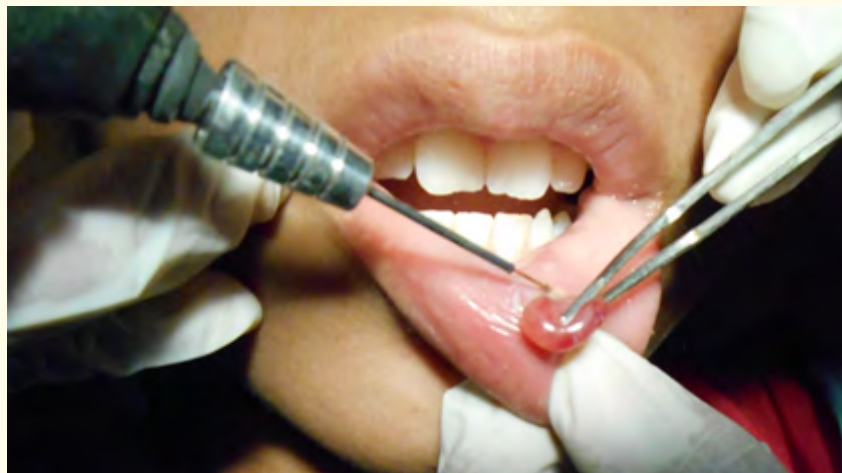
Figure 2: Demarcation of Periphery of the lesion.

The periphery of the lesion on lower lip was first marked with diode laser fiber tip in contact mode at low power setting (1.3 Watts, 0.10 ms pulse interval, 0.05 ms pulse duration) to determine the extent of the excision of capillary hemangioma (Figure 2).