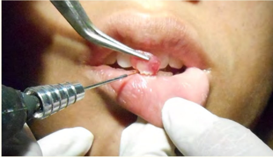
Figure 3: Excision of the lesion.

After complete laser excision, lesion was sent for histopathological examination. On the basis of clinical and histopathological examinations, it was confirmed the diagnosis of capillary hemangioma of lower lip (Figure 4,5).