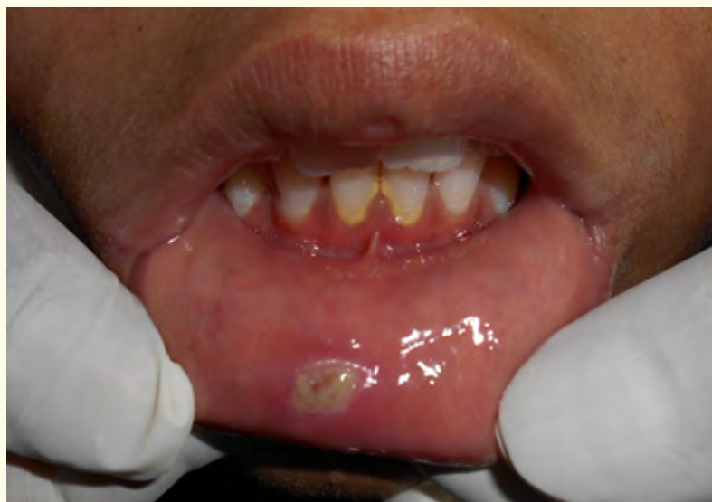
Figure 6: Post-Operative view after 7 days.

Patient was recalled on follow-up at 7 days, 21 days and 1 month and also advised not to take spicy and hot food for a day. There had been no recurrence of the lesion over the 6 months (Figure 6,7).